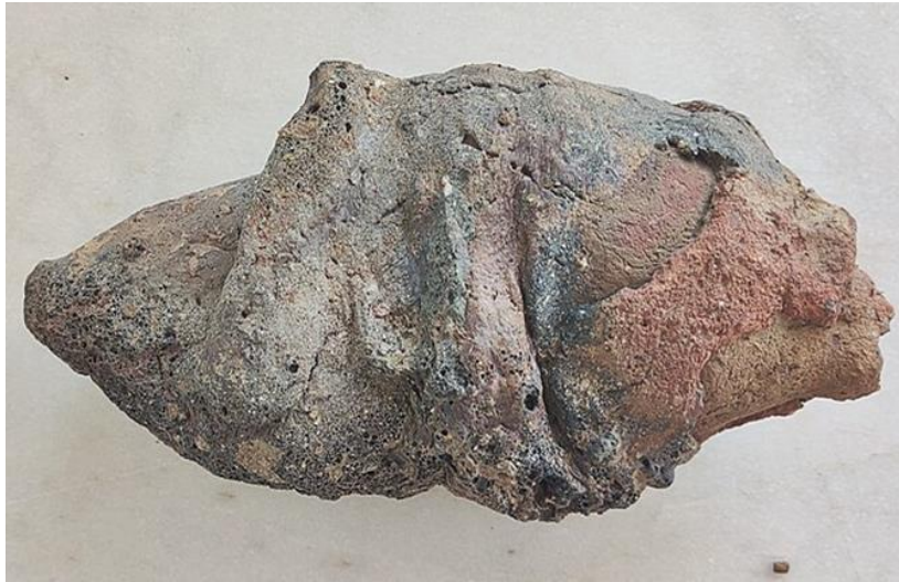
Figure 2. Ancient Retort

An ancient retort (see image above), used in ancient smelting processes, served several important purposes: