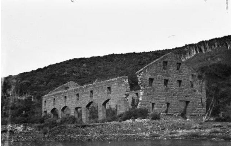
Figure 1. Old House