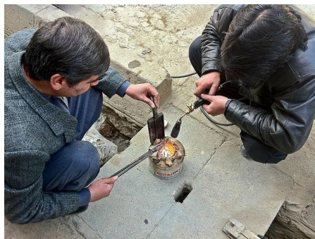
Figure 7. Wikimedia Commons: Low-Tech Smelting of Silver

Silver smelting can also involve pyrometallurgical processes.