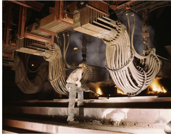
Figure 4. TVA phosphate smelting furnace

It has been instrumental in the production of iron and steel for centuries.