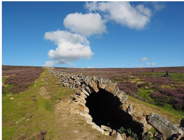
Figure 8. Ruins of the Grinton Smelting Mill Flue, from circa 1820.

As sustainability becomes an increasingly important focus in the steel sector, ongoing efforts to minimize water consumption, improve recycling practices, and implement advanced water treatment technologies will continue to shape the industry's approach to water management.