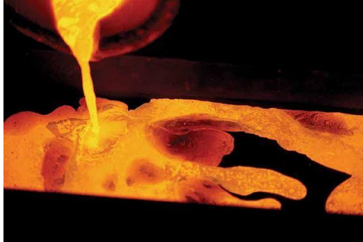
Figure 3. Metallurgy