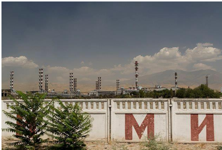
Figure 6. Aluminium smelting plant, Tursunzoda, Tajikistan

The primary method used for aluminum smelting is the Hall-Héroult process, which is an electrochemical reduction process.